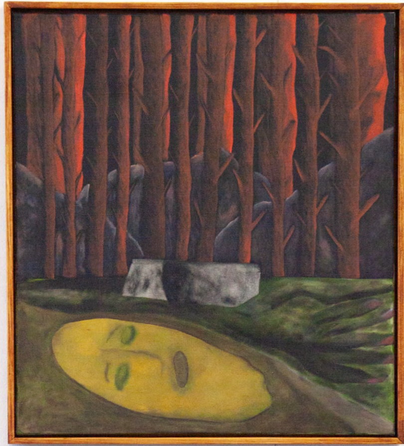
Soñar contigo, 2023 oil on canvas 61 x 55 cm