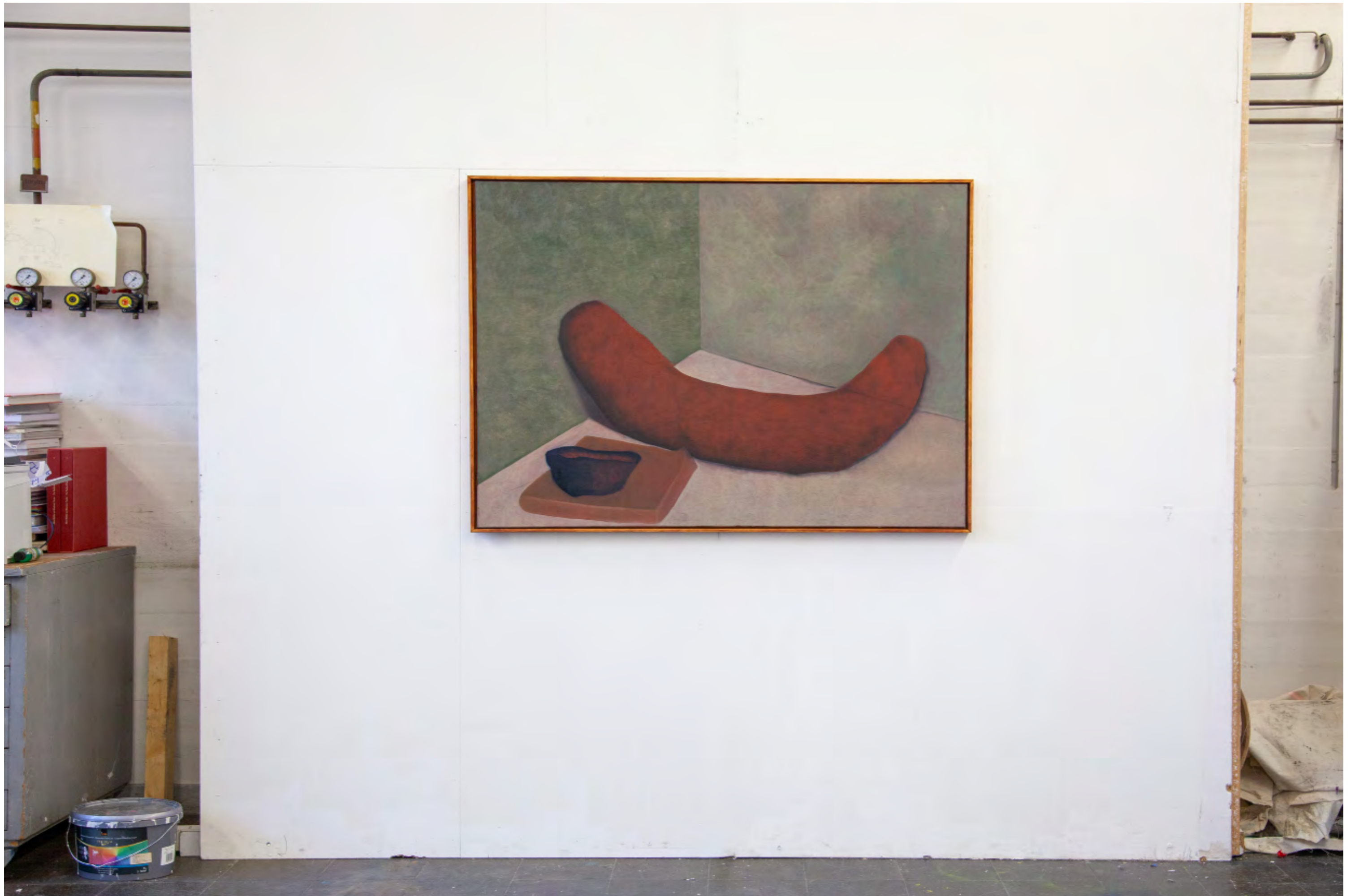
Studio view: Wake me up when its over, 2023, Öl auf Leinwand, 100 x 130 cm