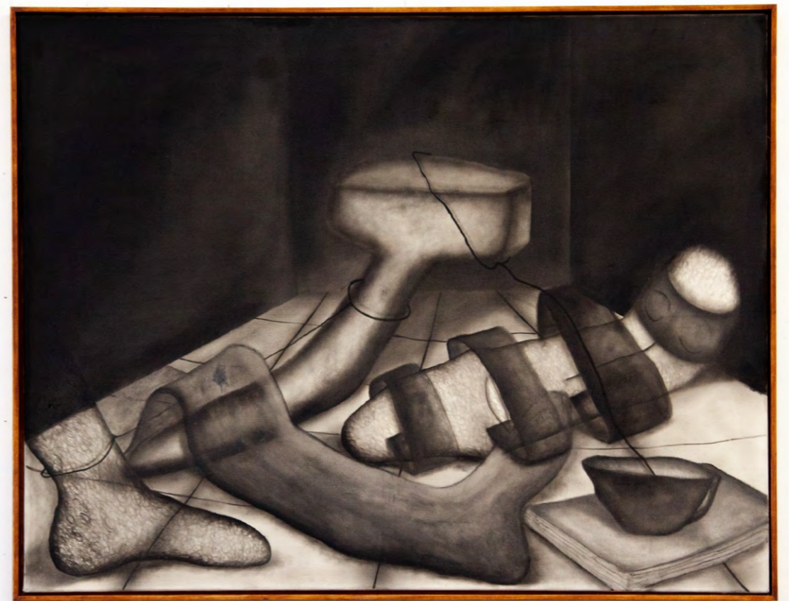
Headache, 2023 oil on canvas 100 x 130 cm