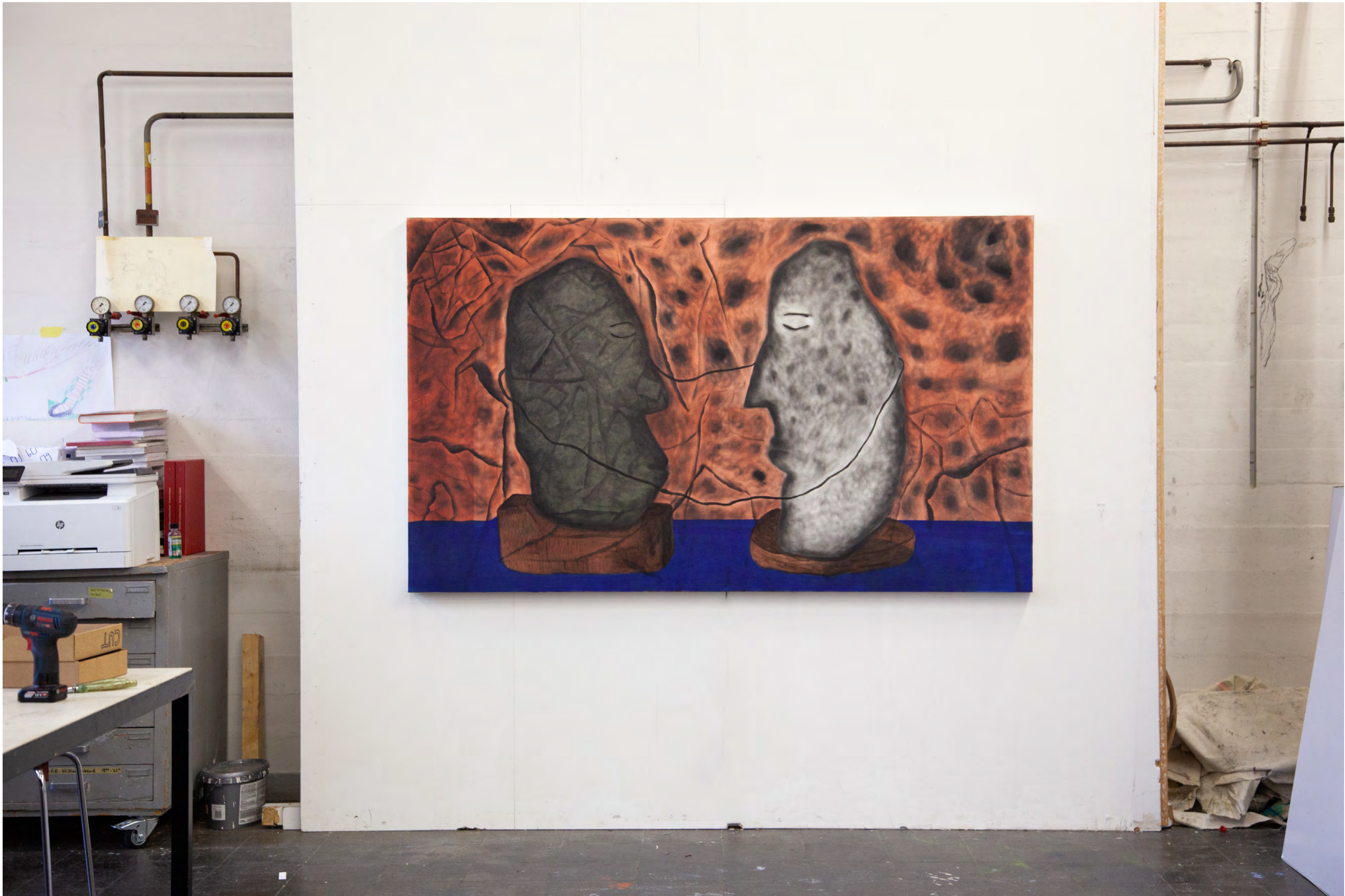
Studio view: Escuchar la brisa del mar, 2023, oil on canvas, 120 x 200 cm