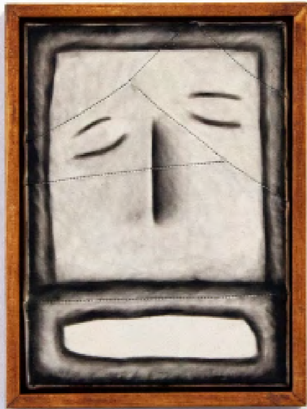
Retrato, 2023 oil on canvas 30 x 21 cm