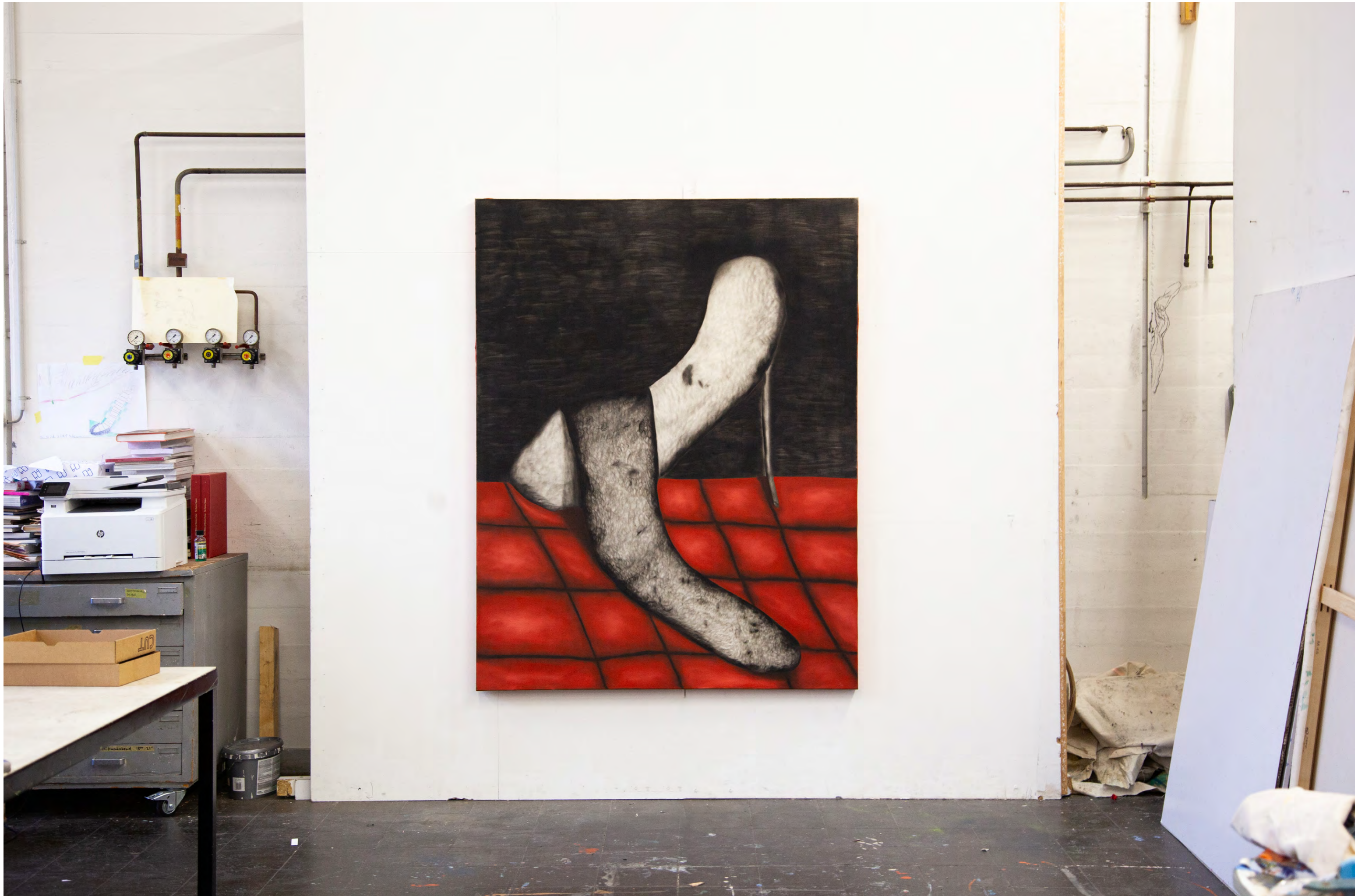
Studio view: Escuchar la brisa del mar, 2023, Öl auf Leinwand, 120 x 200 cm