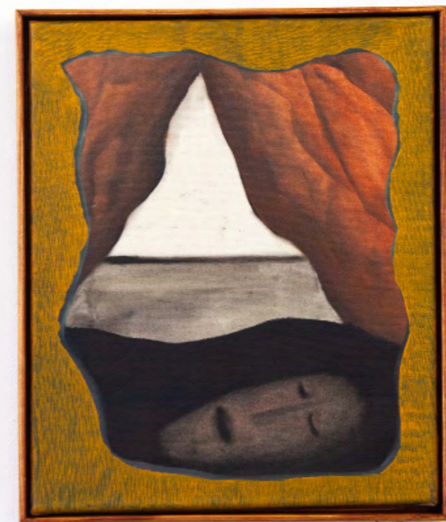
Siestuki, 2023 oil on canvas 40 x 30 cm