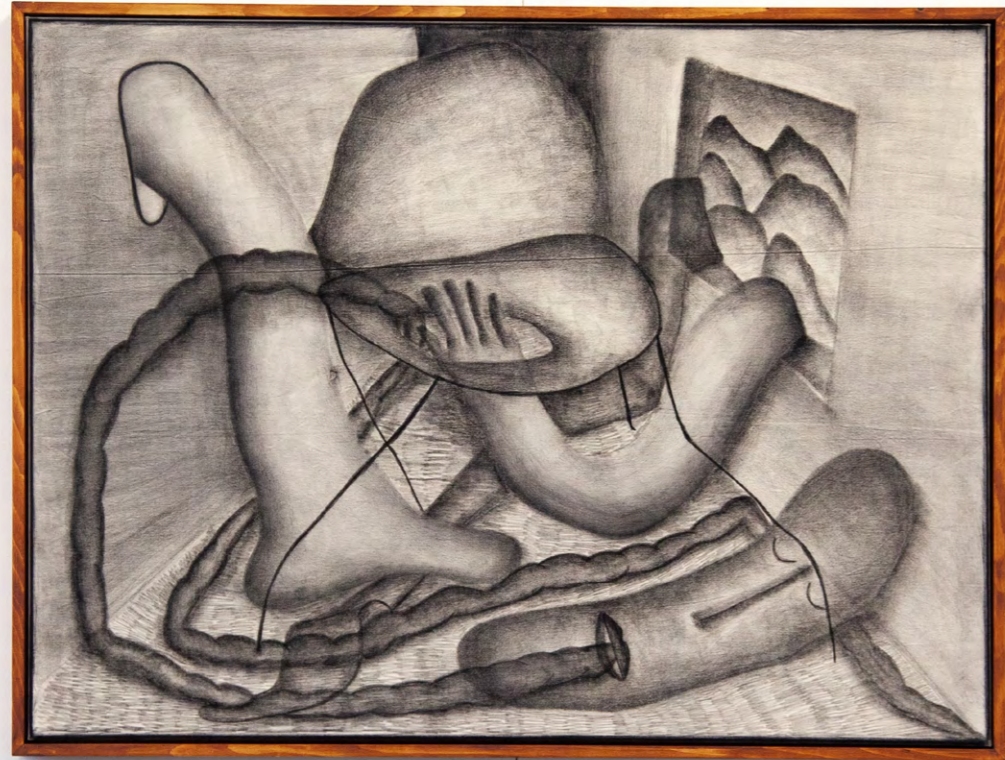
Fiasko, 2023 charcoal on canvas 90 x 120 cm