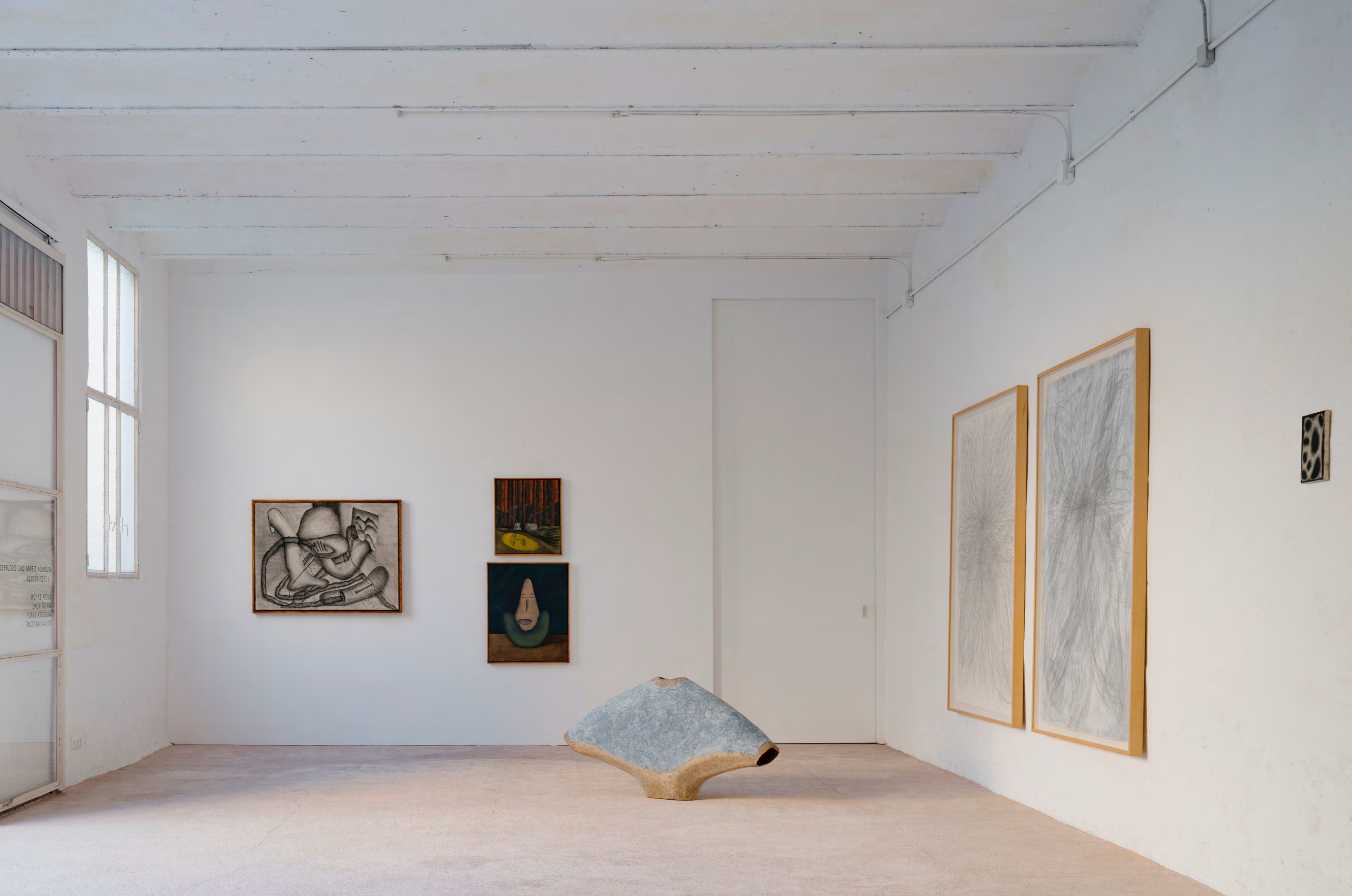
Exhibition view: Querida tierra que oscurece, Gallery Belmonte, Madrid (ES), 2023