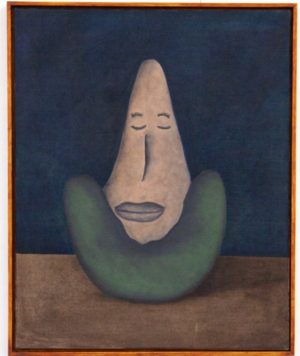
Too boring to be singel, 2023 oil on canvas 80 x 65 cm