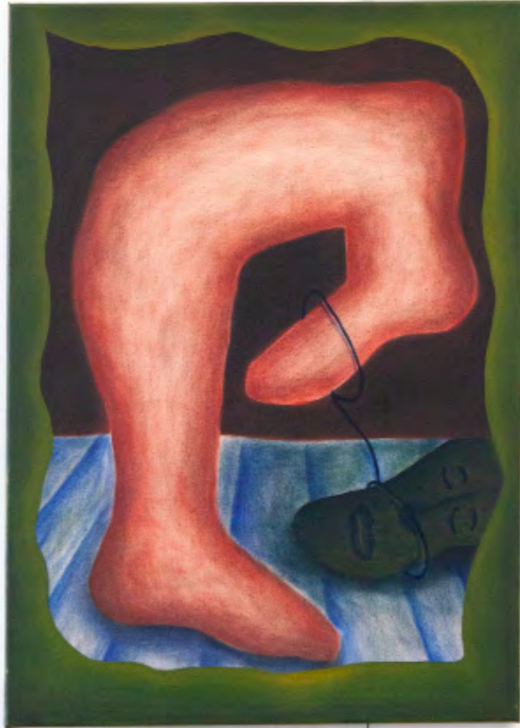
Dónde esta mi mente (Where is my mind), 2023