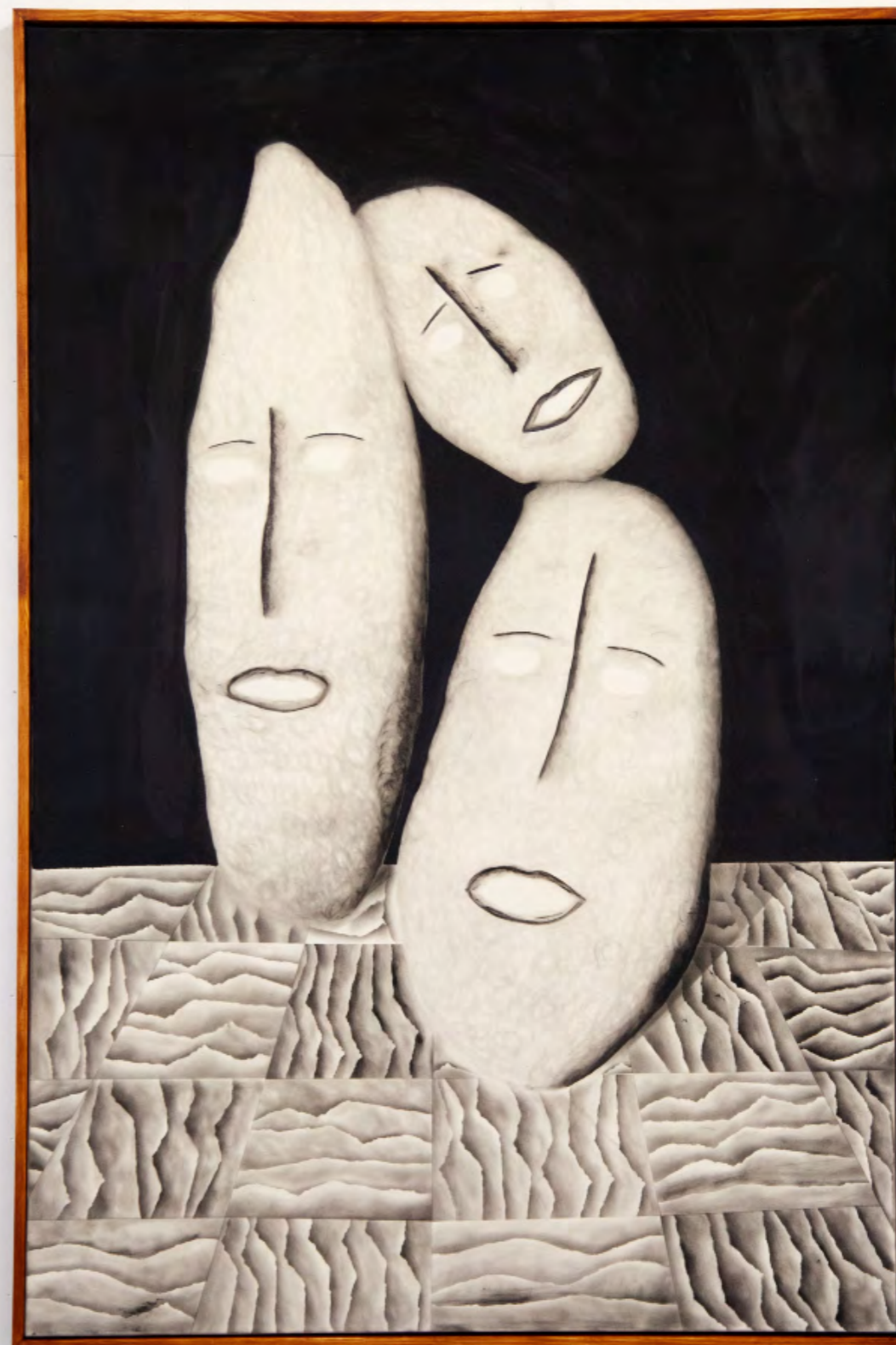
Hermanos, 2023 oil on canvas 180 x 120 cm