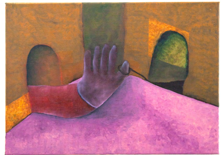
Homestory III, 2024 oil on canvas 50 x 70 cm