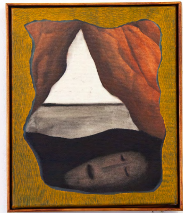
Siestuki, 2023 oil on canvas 40 x 30 cm