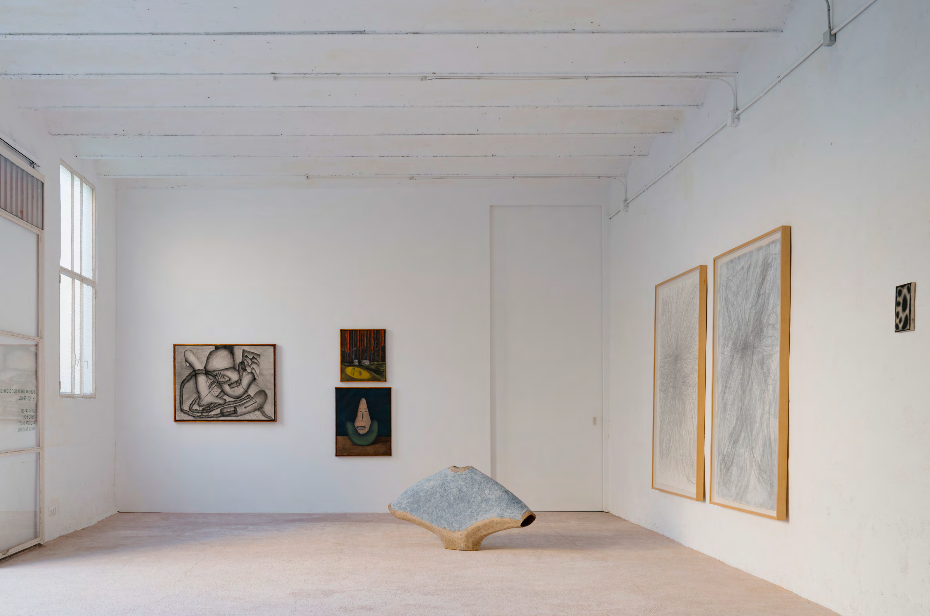
Ausstellungsaussicht: Querida tierra que oscurece, Gallery Belmonte, Madrid (ES), 2023