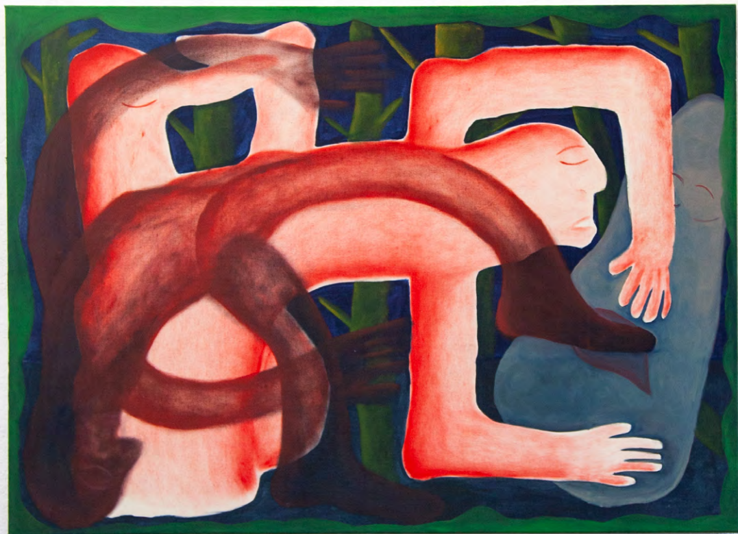
Run through the jungle, 2024 oil on canvas 100 x 130 cm