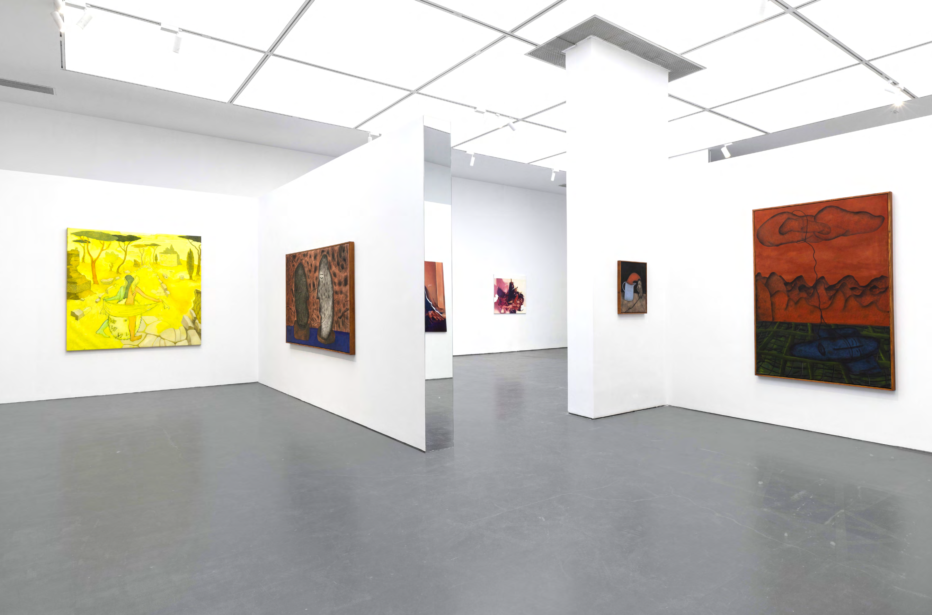
Installation view of “The Arcadian Dream,” SPURS Gallery, Beijing, 2024.