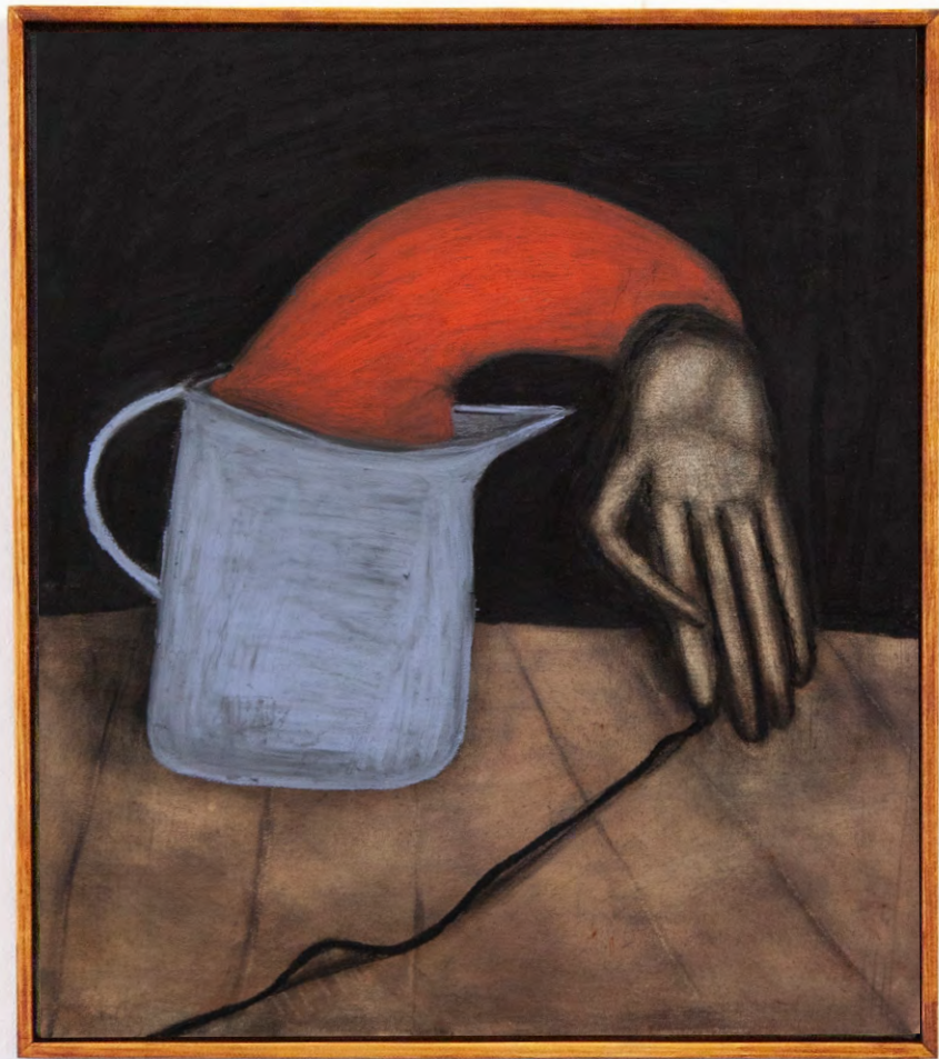
Te tengo II, 2024 oil on canvas 60 x 50 cm