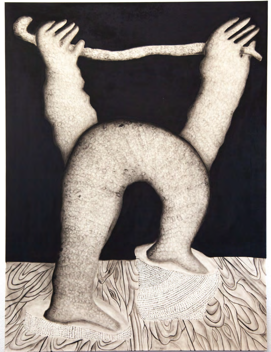
Life Balance, 2024 oil on canvas 160 x 120 cm