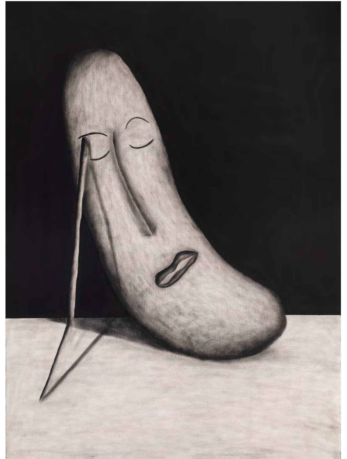
Monday Morning, 2024 oil on canvas 130 x 100 cm